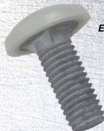
Fin Neck Encapsulated Bolts (NSF Approved)