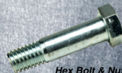
Hex Bolt & Nut