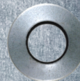
Rubber Bonded Washers